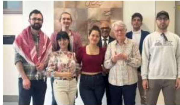
Some of the 20 HDR students currently undertaking research at CAIS. A total of 10 HDR students completed their PhDs in 2023/24